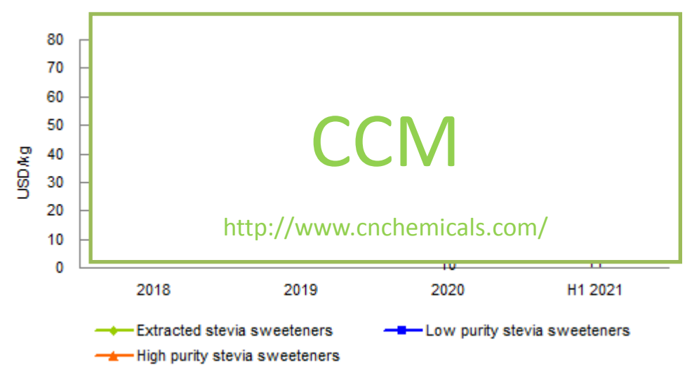
Figure 3.2-1 Annual average market price of stevia sweeteners by product grade in China, 2018–H1 2021

Note: The price of each grade of stevia sweeteners is the average price of all specifications in that grade.