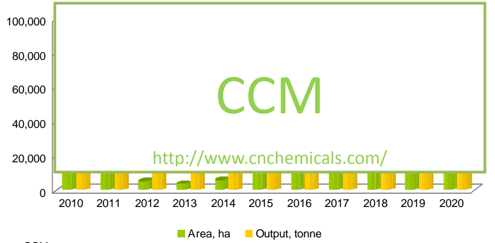
Figure 2.1-2 Stevia planting area and stevia leaf output in China, 2010–2020